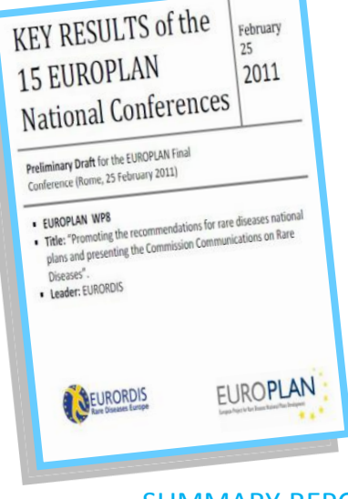
SUMMARY REPORT of the 15 EUROPLAN National Conferences organized by EURORDIS